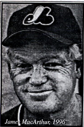
James MacArthur, 1996