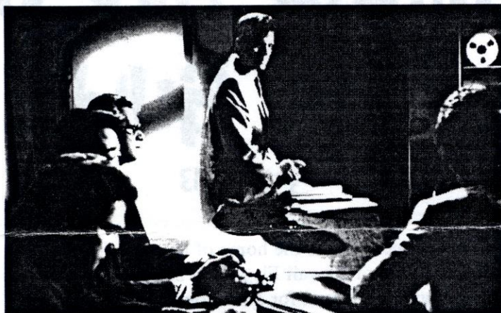
The team discusses its parking tickets in episode #281

Having the ability to park in the most illegal spot has always been a job perk for the Five-O team, until now. Everyone begins to find parking tickets on their windshields. McGarrett ignores them until the city threatens to haul them all to jail for having tons of unpaid parking tickets. The Five-O team must discover who is playing angry meter maid before McGarrett is forced to arrest himself.