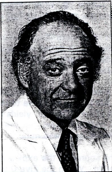
Ed Flanders in 1982

"Ed Flanders was a critical part of a series that represents some of the best in the history of NBC's programming," said Warren Littlefield, president of NBC Enter-